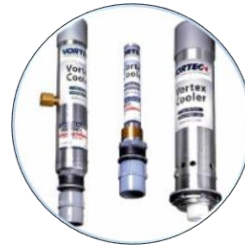
Mini Cooling Devices